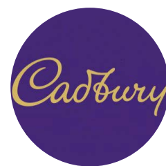
Colour Cadbury purple