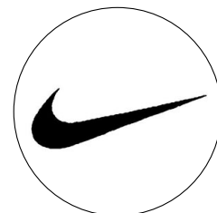
Logo Nike swoosh