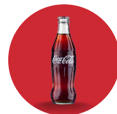
Shape Coca-Cola bottle