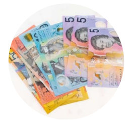
Substance Polymer (plastic) bank notes