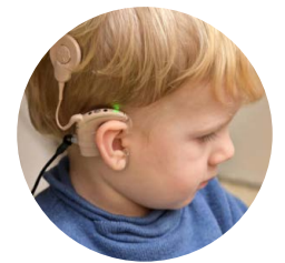
Device Cochlear implant