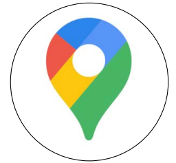
Technology Google Maps